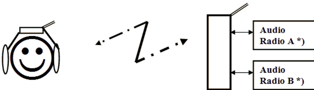
Wireless Stereo Phone Set 800 Mhz (€40) *) Keep the Transmit Monitor On

My secret is using standard stereo wireless headphones having A-radio audio on the right ear and the B-radio on left. The operator listens simultaneously both radios RX and TX audio with the rig Monitor ON. Wireless function gives you also freedom to move in the shack for any other important reason - like to take a beer from the fridge in the Ham Shack. See Drawing 3, Listening RTTY SO2R