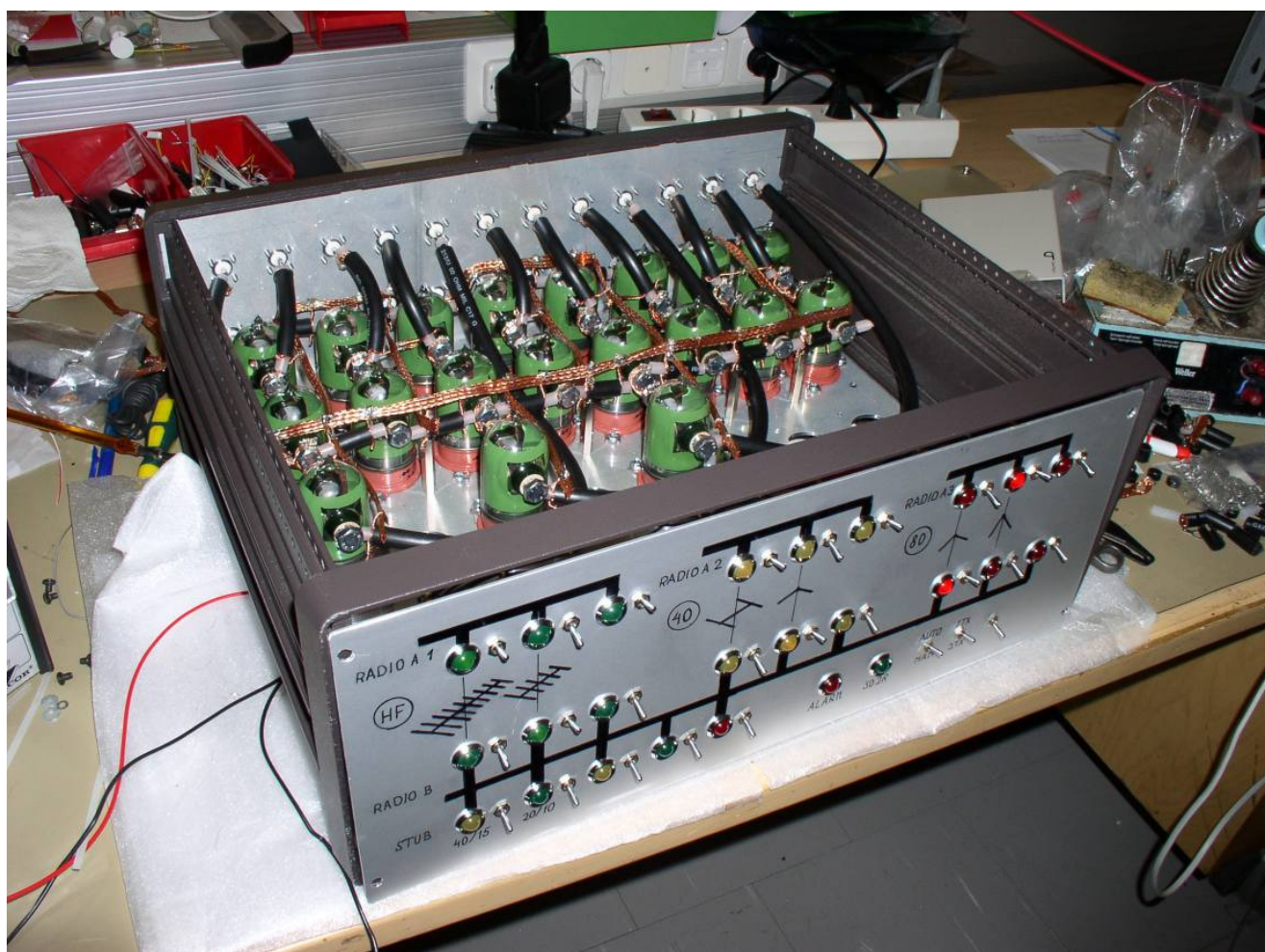
Figure 1. The Antenna Swapper Box.

We all know how a serious Contester highly appreciates this few dB gain archived by the antenna stack to one direction. Stacking might help you to be the first or the only one to get a very rare DX multiplier.